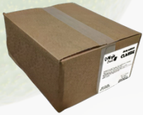
ART WORK (Label for bag)